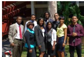
2010 SHI Cohort