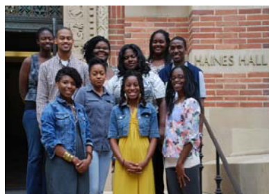
2011 SHI Cohort

In August, the Bunche Center's Summer Humanities Institute (SHI) concluded the 11th year of the program , which prepares traditionally underrepresented students from Historically Black Colleges and Universities (HBCUs) and others with a commitment to advancing scholarship in African American studies, to successfully complete a graduate program in the humanities and humanistic social sciences.