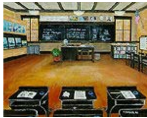
The Three Rs by Fredric Booker